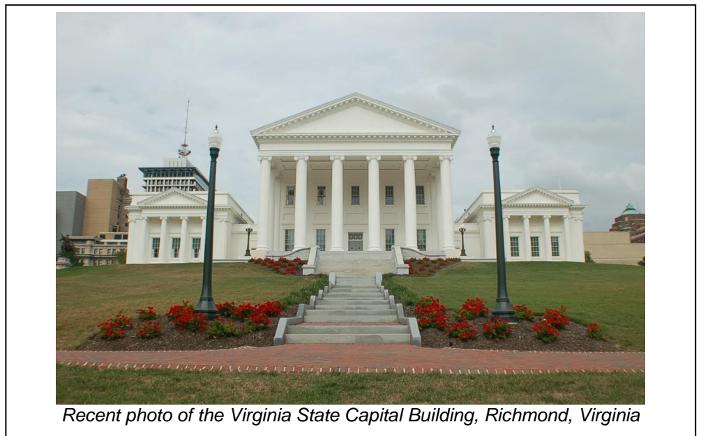
Recent photo of the Virginia State Capital Building, Richmond, Virginia