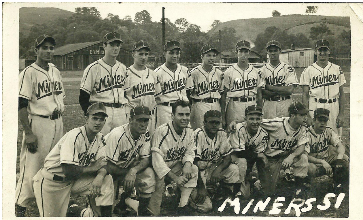
1951 Miners' Baseball Team, Pennington Gap